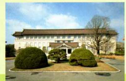
Tokyo National Museum

*The estimated time is based on the route indicated by the dotted line on the map.